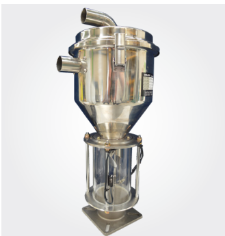
Stainless steel hopper with laser eye level for direct machine mounting.