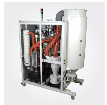
Good access for maintenance.